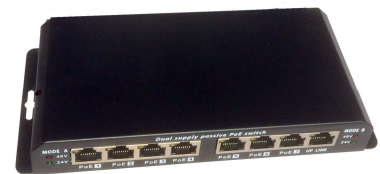
Injector and switch combined

WiFi-Texas.com Inc 815-A Brazos #326 Austin Tx, 78701 512 479 0317 http://wifitexas.com