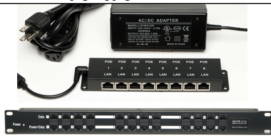
Multiport PoE passive injectors

WiFi-Texas.com Inc 815-A Brazos #326 Austin Tx, 78701 512 479 0317 http://wifitexas.com