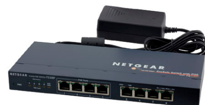
Any PoE Switch